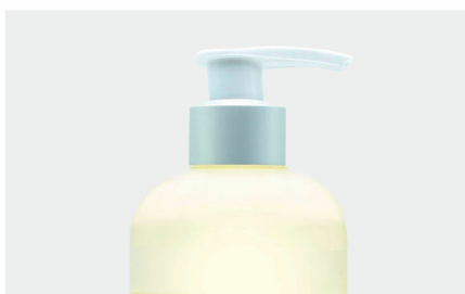
300ml Hand wash