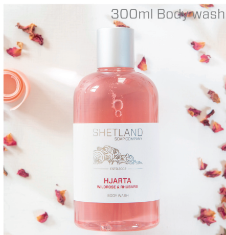
300ml Body wash