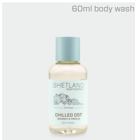
60ml body wash